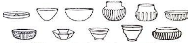
Phial, drinking cups, patella and patera bowls, 1st century B.C.—2d century B.C. Ptolemaic silver, d —probably "simplum" cup, e —Lower row, 1st and 3d A.D.